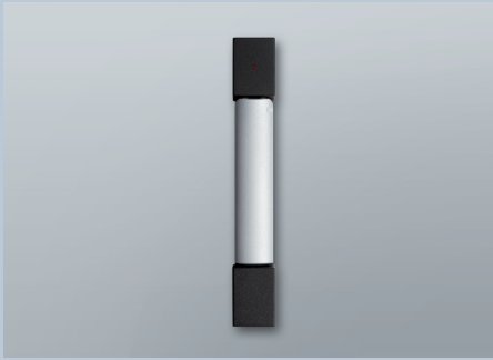
Digital switchgear cabinet handle